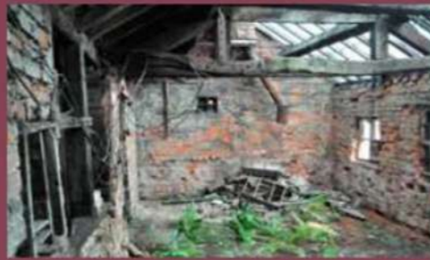
BEFORE: ROTTING TIMBERS