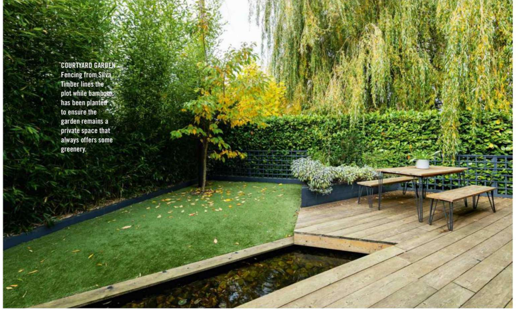
COURTYARD GARDEN Fencing from Silva Timber lines the plot while bamboo has been planted to ensure the garden remains a private space that always offers some greenery.