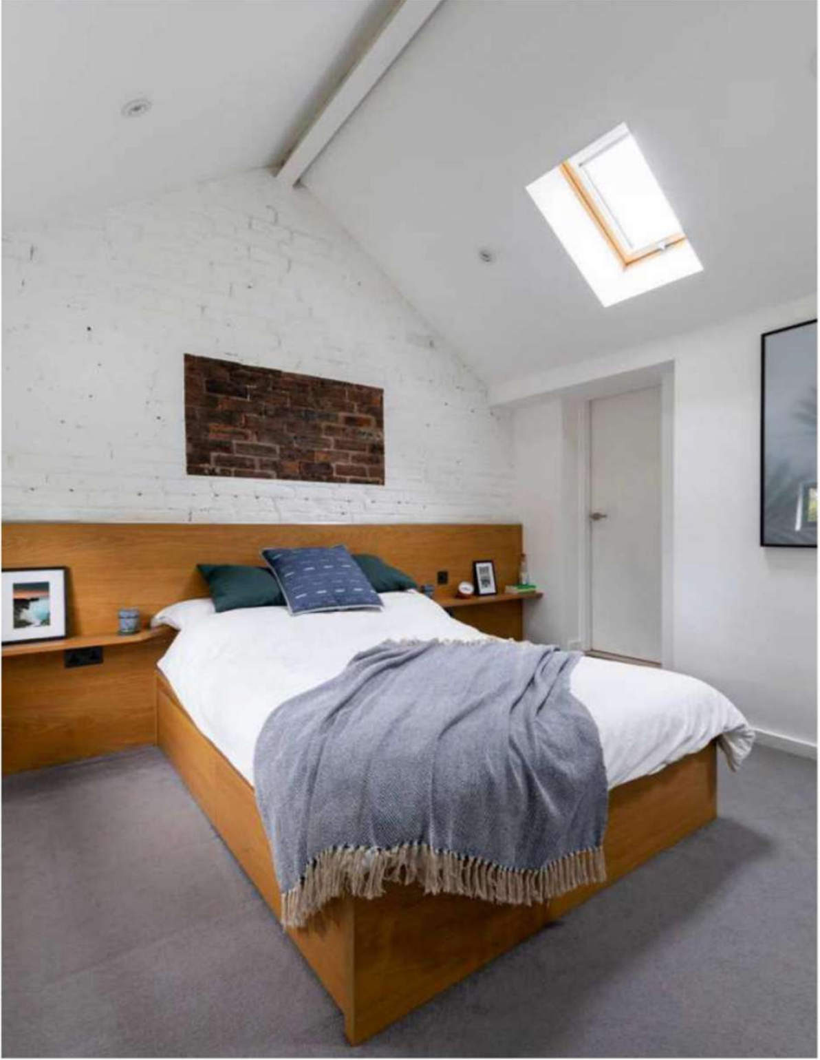
A LIGHT TOUCH Sat alongside the main road and next to the front entrance, the master bedroom had to be creatively designed. The exposed brickwork and built-in bath have a boutique hotel experience in mind while the skylights and vaulted ceiling ensure the room feels spacious without being overlooked.