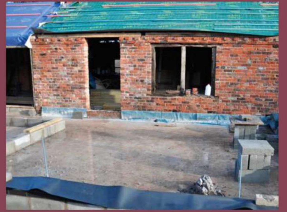
DURING: FOUNDATIONS FOR THE KITCHEN-DINER EXTENSION