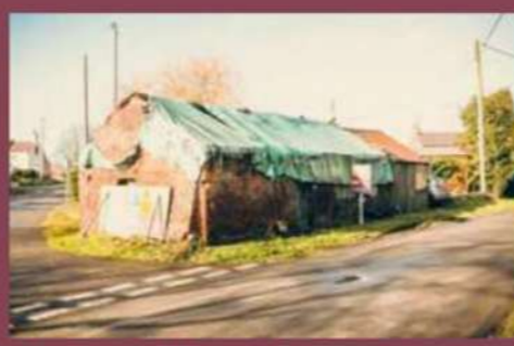
BEFORE: A SPOT WITH POTENTIAL