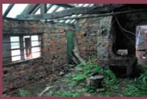
BEFORE: A CRUMBLING FORGE